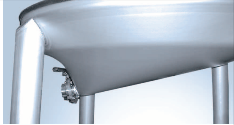
Under-surface and outlet recess have been designed in one piece. This avoids the possibility of deposits forming in welded joints.