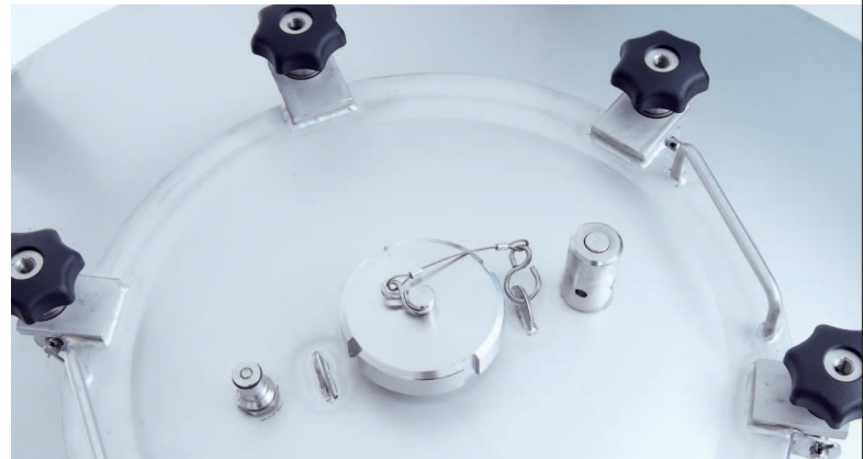
Particularly user-friendly, safe and leak-proof filling method. Compatibility with all common connections is guaranteed.